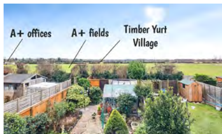
View from the back of the house