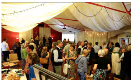
Summer Drinks and Jazz

I hope you enjoy the updates from the rest of the team on the different areas of our Adventure Youthwork - and you will be excited by the new initiative described in our Christmas Appeal to create The Hub, a