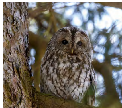
Tawny Owl spotted in the copse

We are looking forward to creating a new hedgerow around our existing copse to create a living boundary this winter. This project represents a significant step forward in our ongoing efforts to safeguard and enhance the natural habitats on our site, and we are confident it will make a substantial difference.