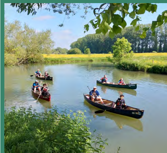
Aim Team canoeing session

The Aim team deeply appreciate your continued support and prayers for the Aim students and instructors throughout the year. Your involvement is vital to our mission, and we are grateful for it.