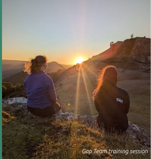
Gap Team training session

To enquire about training with us, contact Graham training@adventureplus.uk