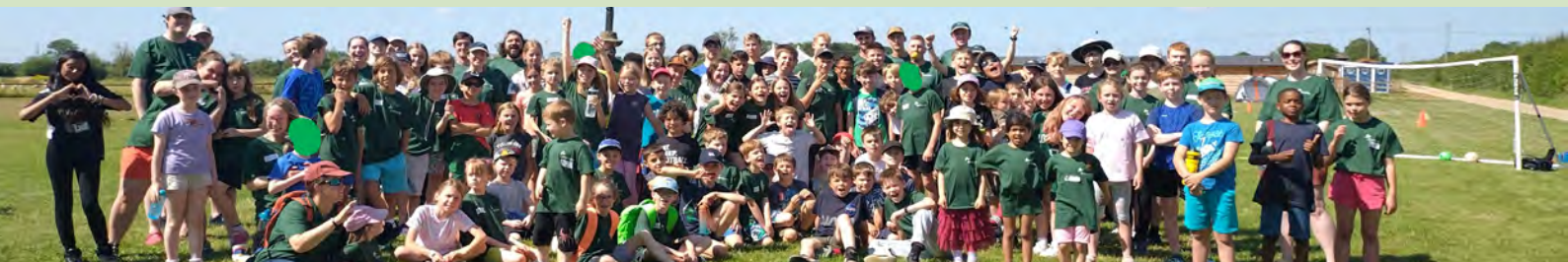
Full camp at Total Adventure Beacon

In summer 2025, we will offer a three-day residential camp for SEND children and their siblings. Open to any child age 8+, the camp will focus on accessibility with smaller groups and a tailored programme. This new holiday will have a limited number of places, so enquire now and be part of this exciting new programme!