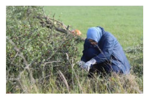
Conservation volunteer, team building day

Over the past year, we have made significant conservation progress, with over 1,000 hedging plants and trees planted on-site. This engaging activity brought together people of all ages to improve local biodiversity and increase our carbon sink, helping remove carbon dioxide from the atmosphere.